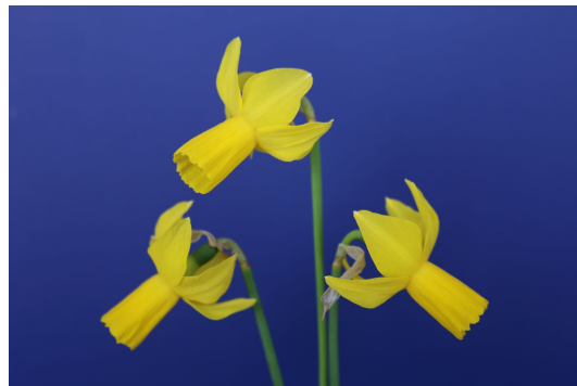
Mini White 'Hummingbird' 6Y-Y exhibited by Becky Fox Matthews