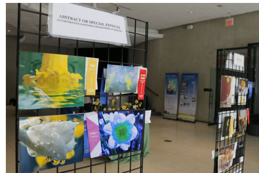
The Photography Division was an