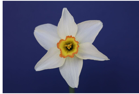
Best Youth Bloom 'Interim' 2W-YYP exhibited by Molly Varner