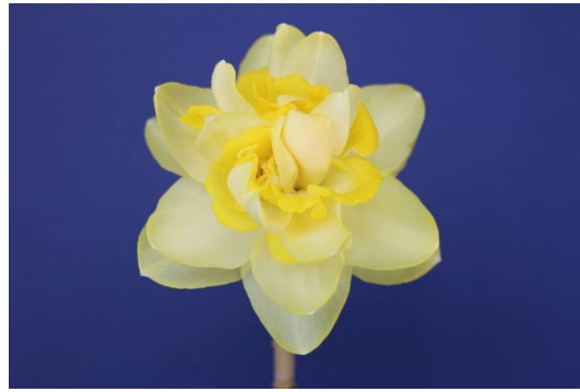
Best Small Grower 'Peach Cobbler' 4Y-Y exhibited by Christine Boys