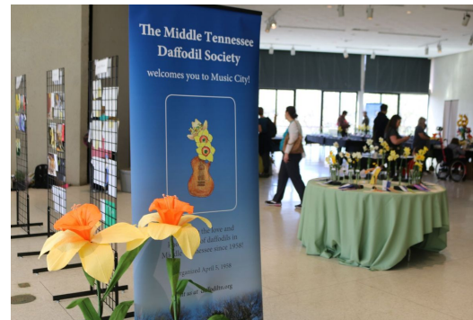
Our "Welcome" banner and giant daffodils greet people to the show.

Copyright © 2019 Middle Tennessee Daffodil Society, All rights reserved.