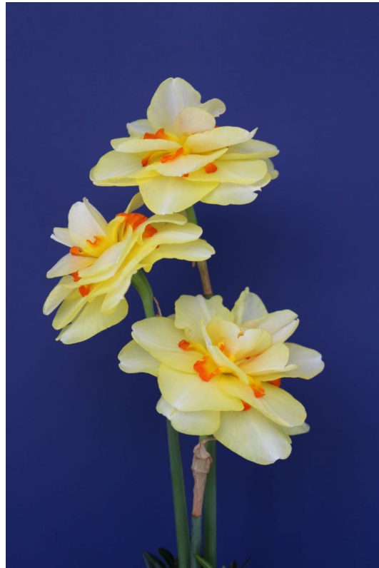
Best Classic Vase of 3 and Best Classic 'Tahiti' 4Y-R exhibited by Bonnie Campbell