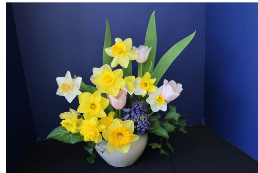
Bonnie Dillingham's "Cheekwood in Bloom", another exceptional blue ribbon design winner