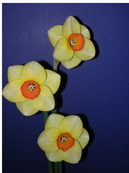
Scarlet Tanager 2 Y-R - Intermediate

The American Daffodil Society has outstanding resources for gardeners. Check out these sites: