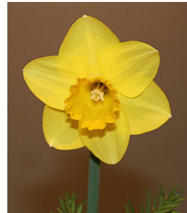
2014 Gold Ribbon Best Standard Bloom in Show Guinevere 2 Y-Y exhibited by Michael Berrigan

Awards potluck and group bulb ordering - guaranteed to be a fun evening!