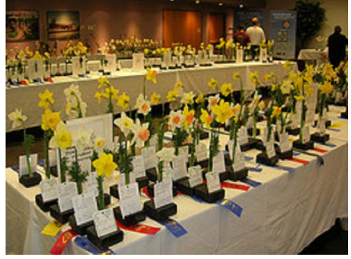
Hundreds of blooms in one room!

If blooms are in short supply there will still be plenty of ways to celebrate spring with fresh daffodil blooms, plus opportunities to learn about daffodils and how to grow them successfully in Minnesota!