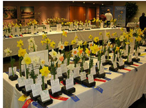
Hundreds of blooms in one room!

If blooms are in short supply there will still be plenty of ways to celebrate spring with fresh daffodil blooms, plus opportunities to learn about daffodils and how to grow them successfully in Minnesota!