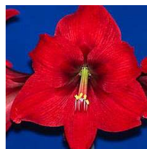
Amaryllis Red Lion

And don't forget to visit these treasures for a mid-winter boost: the conservatory at the MN Landscape Arboretum or the Marjorie McNeely Conservatory at Como Park!