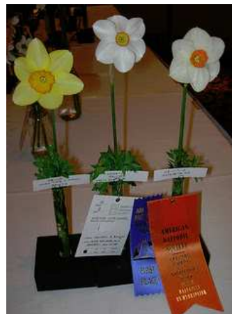
N. 'Miss Bonita' - the center bloom in the Goethe Link Award collection at the 2012 National ADS Show