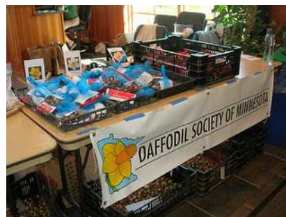
Bulb sales in the fall are our primary fundraiser!