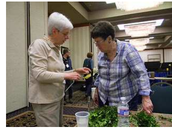
April 26th - hands-on learning how to select and prep blooms for the show!