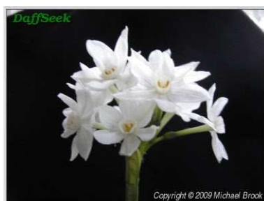
N. Ziva 8 W-W