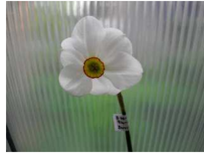
N. 'Miss Bonita' 9 W-GYR