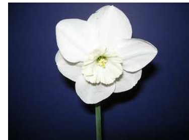
N. Verona Gold Ribbon 2013 DSM Show (best standard in show)