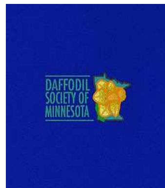
DSM logo embroidered on cobalt blue mesh fabric - just one example of the many possibilities!

The 36th Annual Daffodil Show at Bachman's is always a spring highlight.