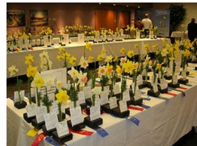
Hundreds of blooms in one room!

Full details for entering daffodil blooms and photography, and contact information, are available in the Show Schedule ; click on Our Show . It's all at www.daffodilmn.org .