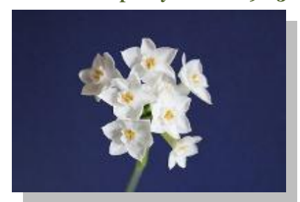
'Trevanion' N. pachybulbous 98-30W