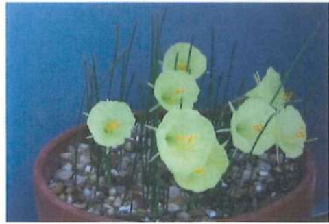
Glenbrook Ta-Julia Group #4/91