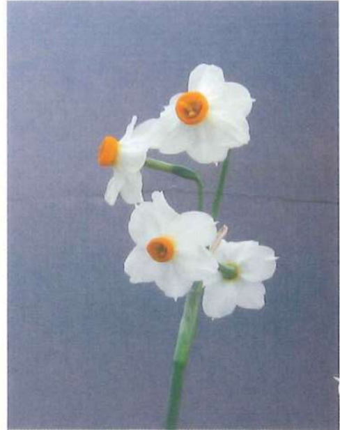
'Glorious' x N. elegans