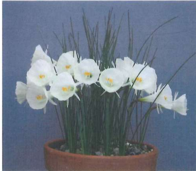
Taffeta Begins to bloom in November

American Daffodil Society: www.daffodilusa.org Northern California Daffodil Society: www.daffodil.org