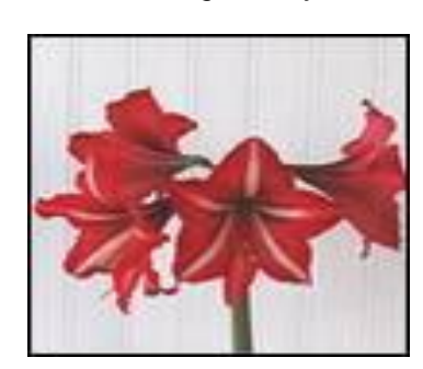
From Organic Style, October 2005

This fall, when my sun freckled hands meet the chilly soil, I'll be thinking about hope as I plant, and about the patience it takes to wait out the cold and the darkness that are necessary for spring blooming – both nature's and mine."