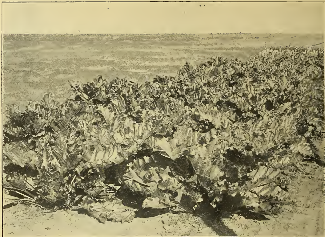
Above photo was taken October 15, 1915