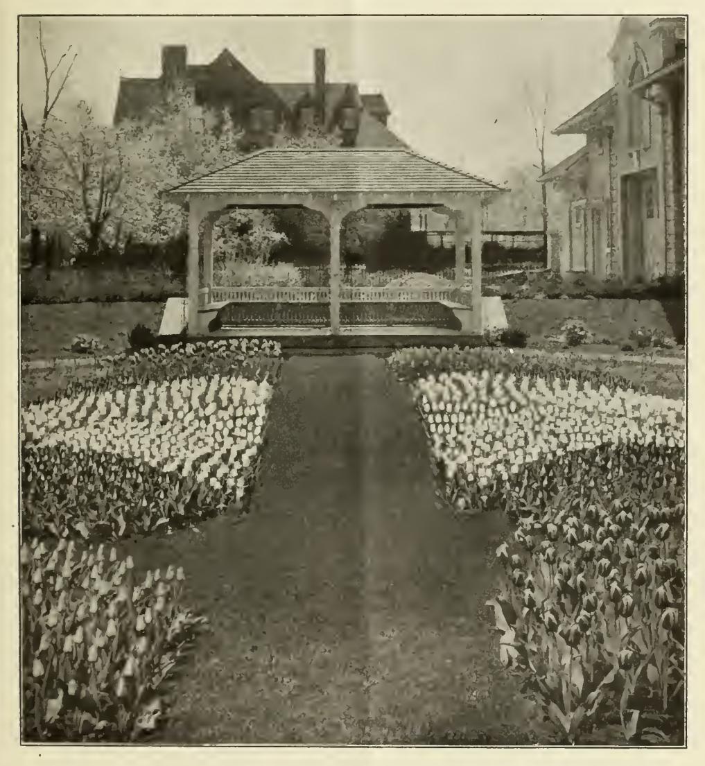
SINGLE EARLY TULIPS IN A ROCHESTER GARDEN