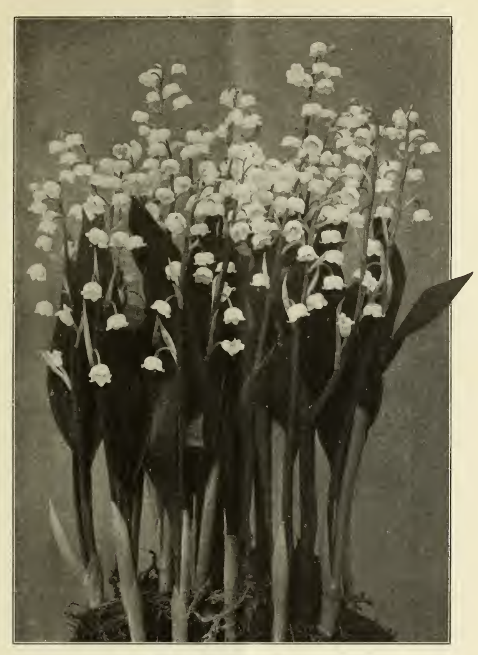
Vick's Extra Selected Lilies of the Valley Are the most Profitable Kind for Florists

Best imported. Will force quickly and flower abundantly. Pips ready in November. Vick's extra selected Berlin, per dozen, 25 cents; per hundred, $1.50; per thousand, $14.00 Vick's extra selected Hamburg, per dozen, 25 cents; per hundred, $1.25; per thousand, $11.00