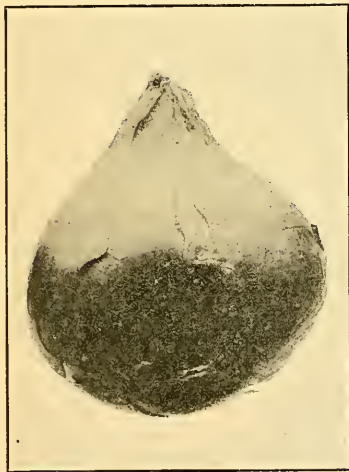
FIG. 1.—Bulb of tulip.

These bulbs should be planted in friable rich soil, devoid of rank and unrotted or poorly incorporated manures. It should be dug to a depth of 12 to 15 inches. The tulip bulbs should be set 5 inches