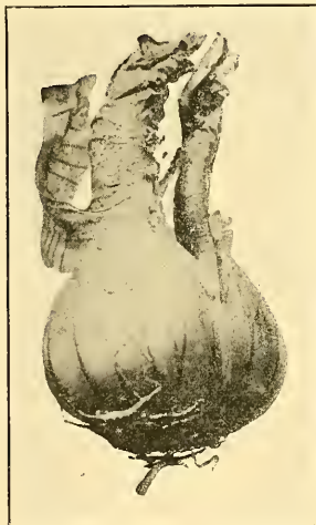
FIG. 2.—Bulb of narcissus.

apart and 4 inches deep and the narcissus bulbs about 10 inches apart and 5 inches deep. The tulips should be planted some time during October, preferably about the middle of the month. The narcissuses should be planted some time between the middle of September and the last of October, preferably about the first of October.