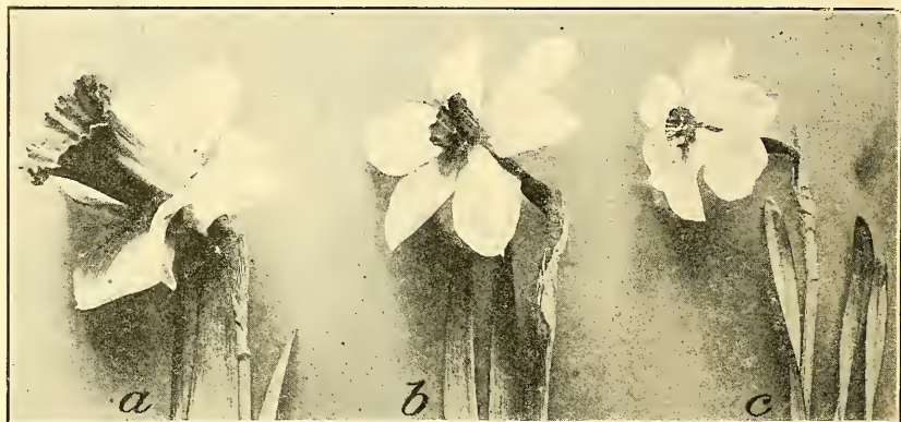
FIG. 4.—Blooms of Emperor ( a ), Barrii Conspicuus ( b ), and Poeticus Ornatus ( c ), representing the three principal types of narcissus, with large, medium, and small crowns, or trumpets.

Tulips and narcissuses, as well as hyacinths, are known generally as Dutch bulbs, because the growing and marketing of these bulbs is one of the principal industries of the Netherlands. Bulbs are also grown extensively in southern France, in England, Ireland, and the island of Guernsey. Most of the bulbs sold by florists and seedsmen in the United States are imported directly from the Netherlands, the annual importations amounting to nearly a million dollars in value. Tulips and narcissuses can be propagated and grown successfully along the Atlantic and Pacific coasts and in the region of the Great Lakes, but owing to the cost of labor only comparatively limited areas have been planted. The largest areas devoted to the grow-