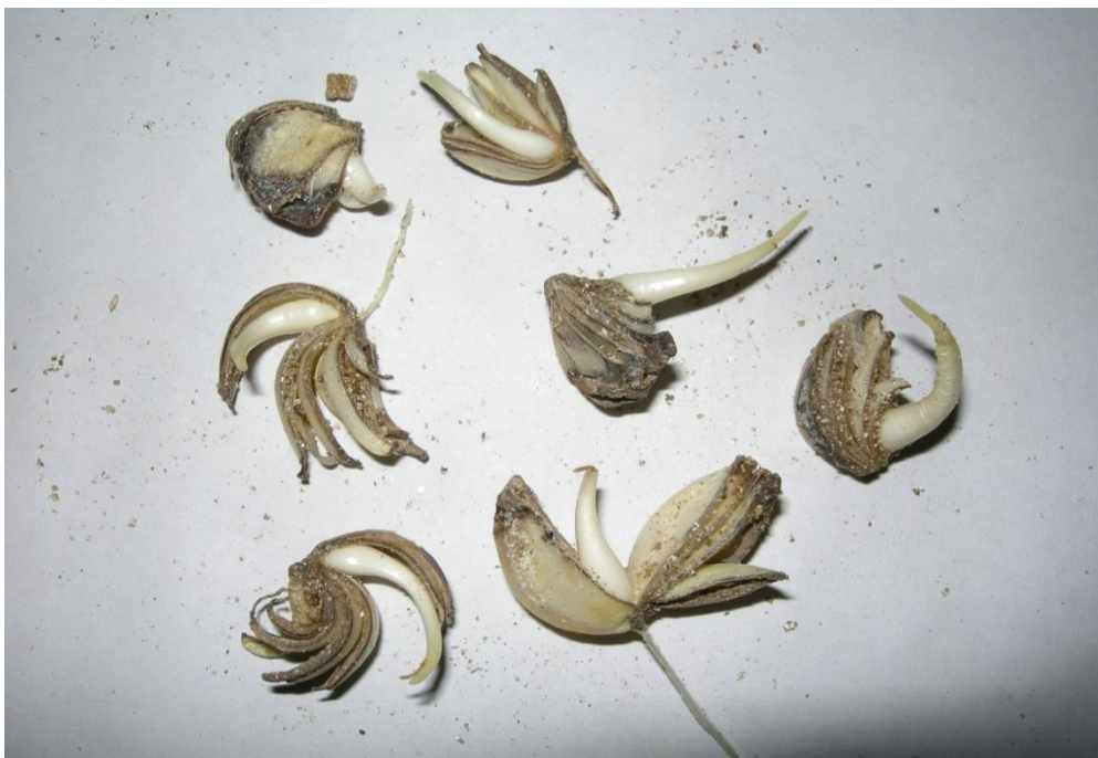
Figure 4: Little bulbs after three months in the heat box

For chips of Hawera it was found out that they form little bulbs with a size of 0,3 mm within 15 days at 20 centigrade. After 7 days, the bulbs should be much smaller. The chips were washed under flowing water and given in penetrable nylon bags to a solution of 1 l water with 10 mg Oryzalin solved in 2 ml DMSO (Dimethylsuloxide) for 48 h at 20 centigrade. The solution with the chips was agitated with an underwater pump. The container was assembled within a fridge at 17 centigrade, because the pump otherwise heats up the solution to more than 20 centigrade. After this operation, the chips were held in agitated clear water for 24 hours, taken out and treated with the fungicide solution. Thereupon they were filled into plastic bags together with moist vermiculite and kept at 20 centigrade for three months within a heat box. During this time the little bulbs become bigger and in the end (Fig.4) they were planted into a peat compost (called TKS1 in Germany) at a temperature of 15 centigrade for the first month, 10 centigrade for the second, and 8 centigrade for the third. Then in March and later the planting bed under glass has not been heated. The twin scaling or chipping is made during August and the early part of September with the best results. The chips should have a weight of about one gram.