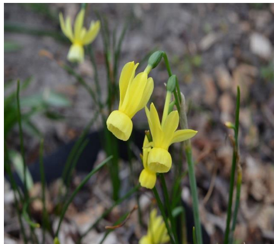
Figure 2. Transformed Fairy Chimes

Hybrids of genetically different diploid species are commonly infertile. Some plants only generate a few unreduced pollen and / or egg cells. If the hybrid is transformed from diploid to tetraploid or to a special mixoploid (chimera), it becomes fertile because the whole tissue or the tissue for reproduction contains two chromosome sets from each species. In addition, the bigger cell nucleus for tetraploids often induces bigger cells and therefore a bigger plant with more substance.