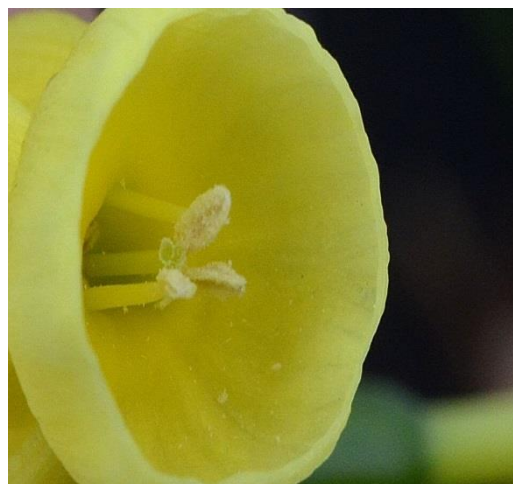
Figure 6. Fairy Chimes with pollen

About 60 to 70 % of the diploid pollen that measures about 46 \mu\text{m} for the short axis sprouted (Fig.7 and Fig. 8). For the normal diploid Hawera I found one flower only of 20 plants with very few unreduced pollen grains (Fig.9) An earlier provisional identification as tetraploid or mixoploid for example by the size of the leaves was not possible because the little bulbs are of different size and generate also plants of different size. The transformation rate was about 1 to 3 %. I am waiting for some further tetraploid or mixoploid plants: Sun Disc, Sun Dial, Angels' Whisper, N. rupicola , N. assoanus , N. cordubensis , and N. henriquesii have been treated for chromosome doubling.