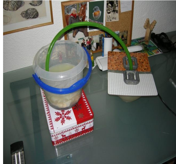
Figure 11. Chips in oryzalin solution

In the best case, the new tetraploid or special mixoploid Hawera and Fairy Chimes are not only fertile but look better and have more vigour than the originals. Selfed or crossed with each other they should generate three types of beautiful plants either of them should be uniform for the first generation. The second generation for Hawera x Fairy Chimes should show some difference in appearance similar to that which can be observed for narcissus species in the wild. If the commerce concentrates on propagation by seed and not by bulb multiplication, it is possible to generate many plants in a short time.