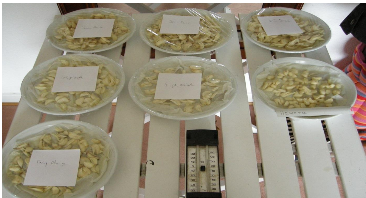
Figure 3. Storing chips for seven days

The following procedure has been used: The bulbs for chipping were hot water treated for 4 hours at 45 centigrade. Thereafter they were placed for 15 minutes within a 0,2 % solution of sodium hypochlorite in water. The fabricated chips were covered for 15 minutes with a fungicide solution of 20 mg Maneb, 20 ml Chlorothalonil, and 20 ml Carbendazim per liter. Then the chips were hold for 7 days at 20 centigrade (Fig.3). They were located on paper with wetted vermiculite underneath and covered with a plastic sheet.