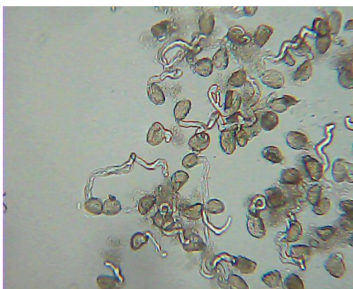
Figure 7. Pollen of the new Hawera

About 60 to 70 % of the diploid pollen that measures about 46 \mu\text{m} for the short axis sprouted (Fig.7 and Fig. 8). For the normal diploid Hawera I found one flower only of 20 plants with very few unreduced pollen grains (Fig.9) An earlier provisional identification as tetraploid or mixoploid for example by the size of the leaves was not possible because the little bulbs are of different size and generate also plants of different size. The transformation rate was about 1 to 3 %. I am waiting for some further tetraploid or mixoploid plants: Sun Disc, Sun Dial, Angels' Whisper, N. rupicola , N. assoanus , N. cordubensis , and N. henriquesii have been treated for chromosome doubling.