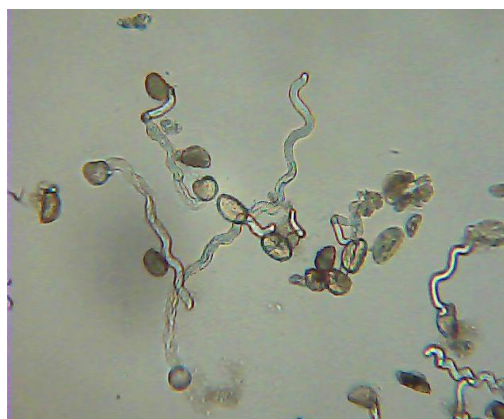
Figure 8. Pollen of the new Fairy Chimes