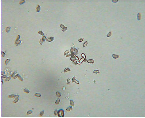
Figure 9. Unreduced sprouting pollen grain of the normal diploid Hawera