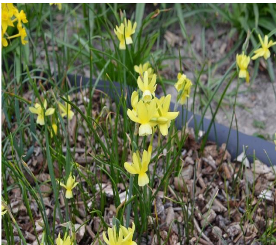
Figure 1. Transformed Hawera

For many years, I tried to transform diploid narcissus species and species hybrids from diploid to tetraploid. At first, I used colchicine, without any success, and later on Oryzalin. With this medium, I was effective. This spring I found one plant of Hawera (Fig. 1) and three plants of Fairy Chimes (Fig. 2) within the treated group that produced diploid pollen. Hawera and Fairy Chimes are both crosses of N. jonquilla with N. triandrus .