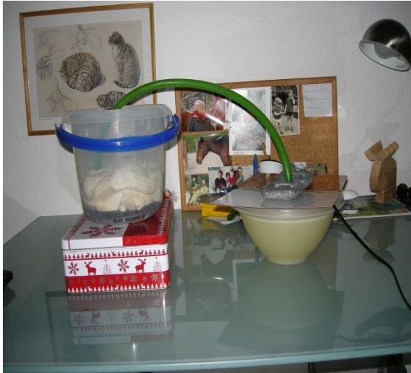
Figure 10. Wetted chips in air