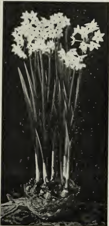
Narcissus (Indoor Culture)