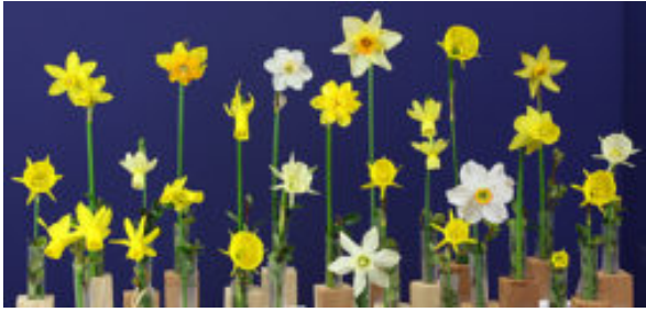
Koopowitz Ribbon winner