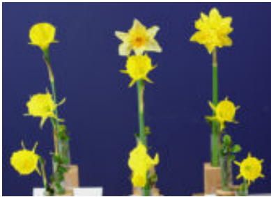
Bankhead Ribbon winner