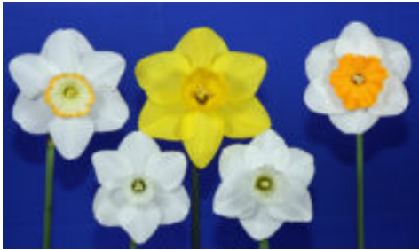
The Purple ribbon collection for the best 5 stem in show was the division 2 collection, exhibited by Lynn Lawson Ladd. The flowers were, Fire Rim, Arleston, Conestoga, Ashmore, and Colonial White.