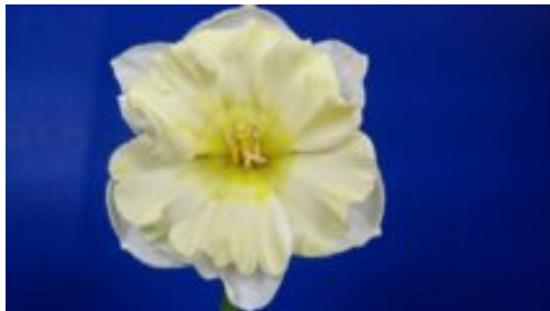
Waipara, Blue Ribbon Winner by Kirby Fong.