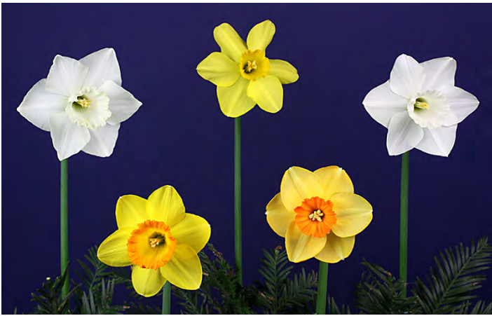
Here's the best collection of 5 standards by a youth exhibitor at the Livermore show. It was entered by Nick Swanson. The flowers are: Back: 'Haoma' 2W-W, 'Quantum' 2Y-Y, 'Lady Diana' 2W-W; Front: 'Hot Gossip' 2Y-O, 'Apricot Jewel' 3O-O.