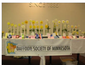
This is the year to participate in a daffodil show!

Contact 612-581-3426 or daffodilmn1@gmail.org to get details!