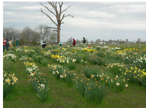
One of nine daffodil plots at the Delaney farm!