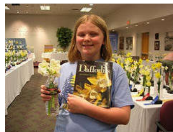
Your child or grandchild can win special awards!

The show has classes and awards for small and new growers (under 50 varieties in your garden), as well as classes and ribbons for youth (age 18 and under)! Invite your children, friends, or grandchildren to enter blooms and/or photographs as well. DSM membership is not required! Email for details, or check out the Show Schedule for tips.