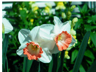
We are in for an early spring - Enjoy!