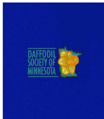
DSM logo embroidered on cobalt blue mesh fabric - just one example of the many possibilities!

One of your benefits as a member of the Daffodil Society of Minnesota is Lands' End merchandise embroidered with the DSM logo! Wear your love of daffodils on your "sleeve" - or canvas bag or polo shirt or many other clothing and merchandise options!