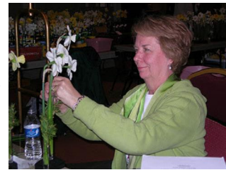
Preparing blooms for show is easy - learn how!