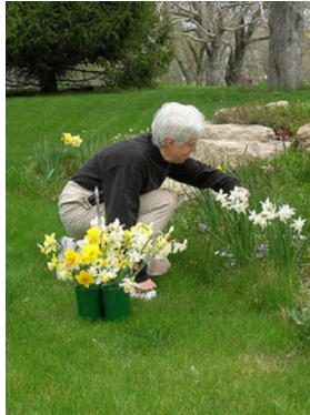
Learn about selecting great blooms for the show!

Of particular note is a new event to 'de-mystify' entering daffodils in our May show - put Saturday, April 26, 9:00 to 11:00 , on your calendar! We encourage all members to come learn " How to Select and Prep Flowers for the Show ". It is for anyone