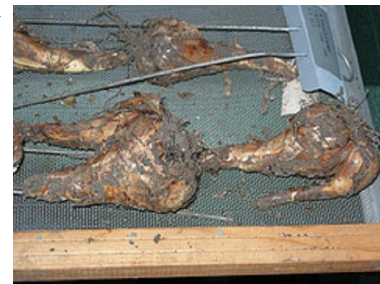
Help clean the dirt off bulbs and bag them for sale