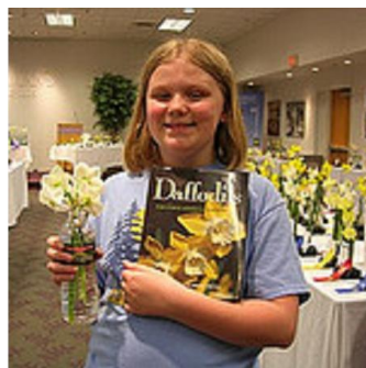
Youth growers have a special section in the show!

Contact us via email with any questions or for last-minute updates: daffodilmn1@gmail.com