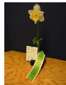
YOU could win the Best New/Small Grower Ribbon!