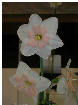
Lovely 'split' white-pink entry

We need your help to mount a successful show on May 18-19!