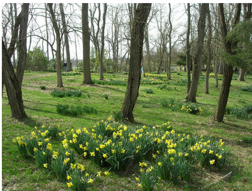
Jill Griesse's naturalized daffodils on the final day of the convention. A slice of heaven on earth, for sure.