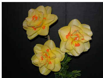
Tahiti - 4 Y-O

children, friends, or grandchildren to enter blooms and/or photographs as well - DSM membership is not required! The Show Schedule has the details, or email with questions.