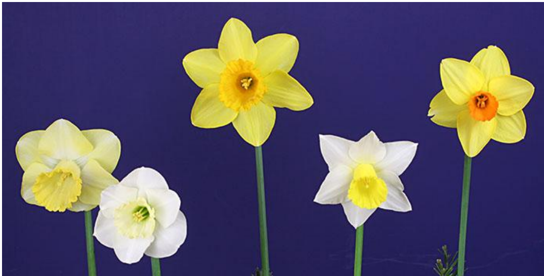
Best Collection of Five in the Youth Section Sierra Johnson Back row: Clouded Yellow 2YYW-W, Drewrys 1 Y-O, Torridon 2 Y-O Front row: Brierglass 2W-GWW and Fort Mitchell 1 W-Y