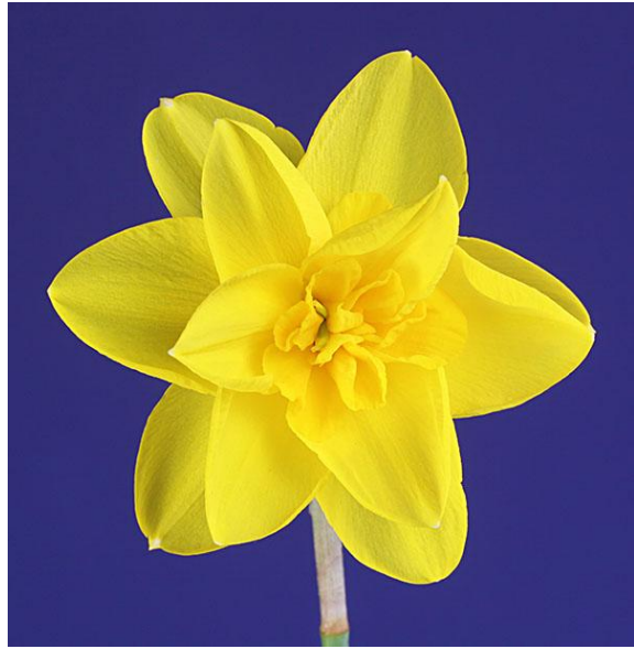
Small Grower Winner Becky Hopewell Double Smiles 4 Y-Y