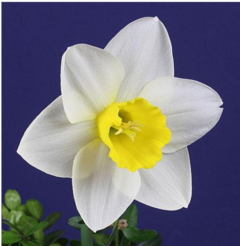
Youth Single Stem Winner Jessie Becker Edge Grove 2 W-Y