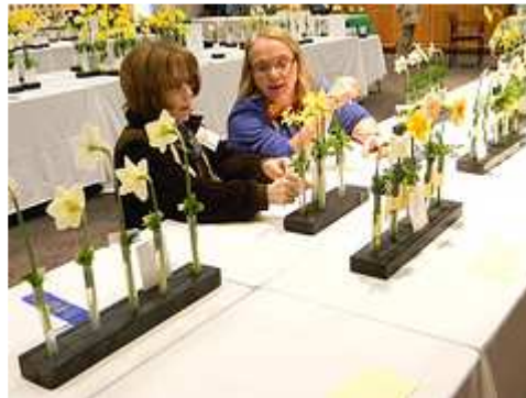
Volunteers make the show possible - plan to help out this year!

We will be at Bachman's on Lyndale again, setting up on Friday afternoon, May 3rd. Plan to come, and enter flowers! If you have never entered before, you will receive 10 show quality bulbs after you enter the first time!