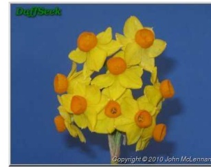
Grand Soleil d'Or - great for forcing in our climate

I potted bulbs for forcing so I can collect the pollen for hybridizing, and bulb orders that came too late to risk planting out of doors. Giant amaryllis bulbs seemed to get larger with each store where I saw them, until finally I had to go buy more pots (plus just a few more bulbs of Grand Soleil d'Or )!