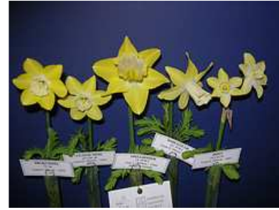
Ethel Smith's 2012 "Maroon Ribbon" winner (best collection of five reverse bi-color stems)