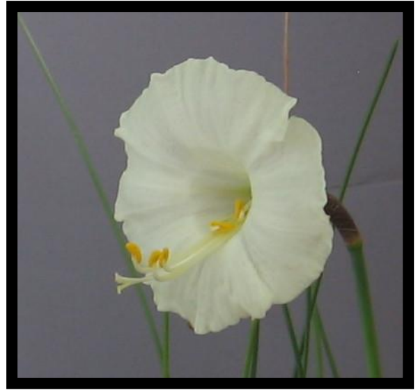
Nylon Group “Wide Flowering” Form