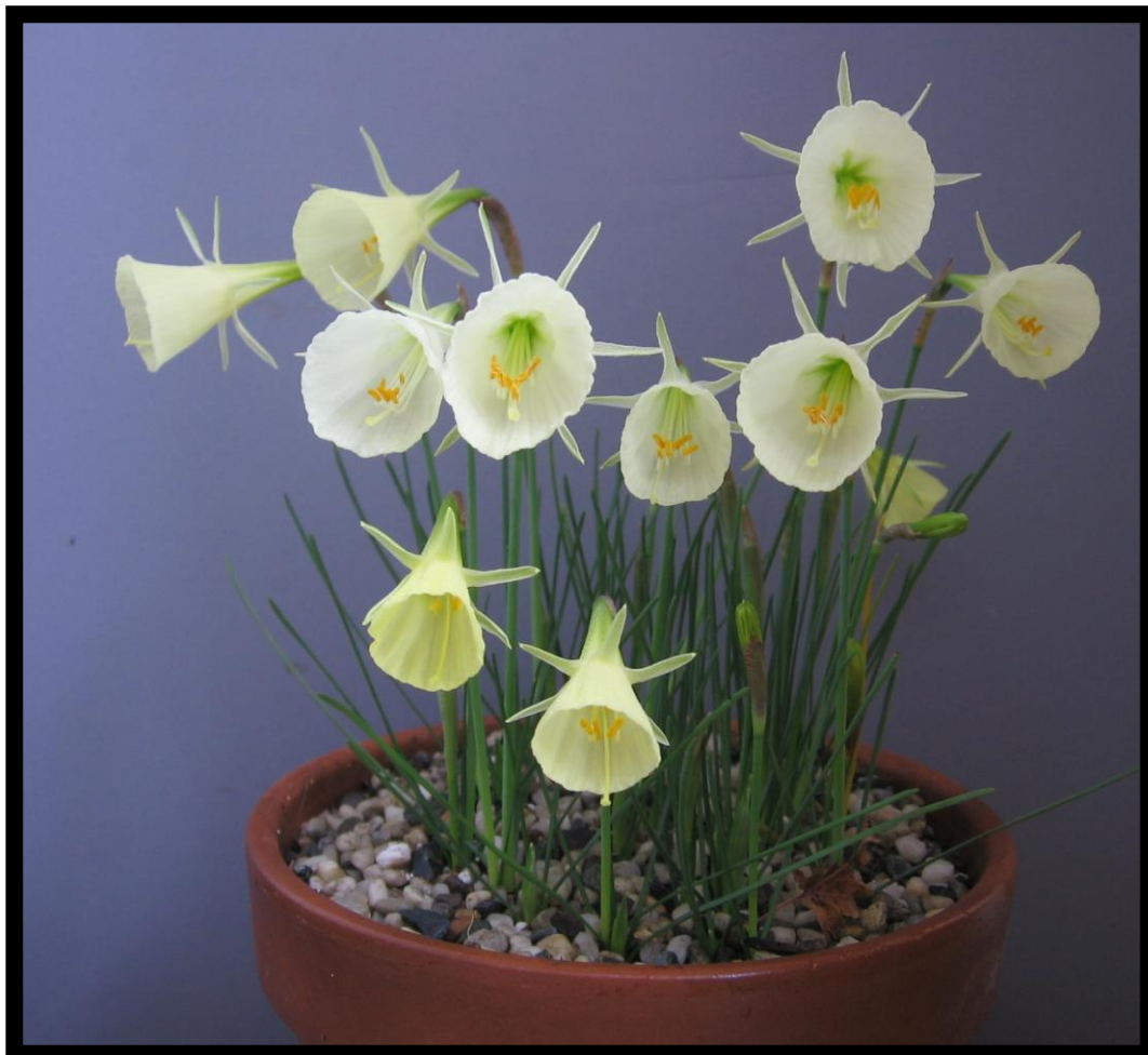
Ianmon 10 W-W