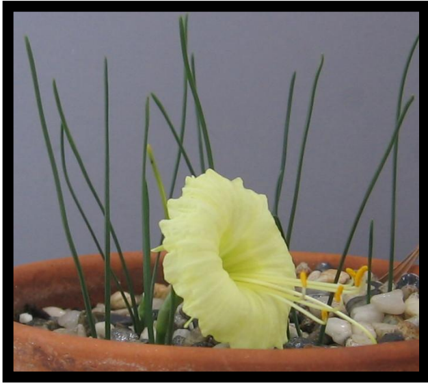
Selection seedling from a “Julia Jane” cross

These bulbocodiums normally bloom for me in January and February.