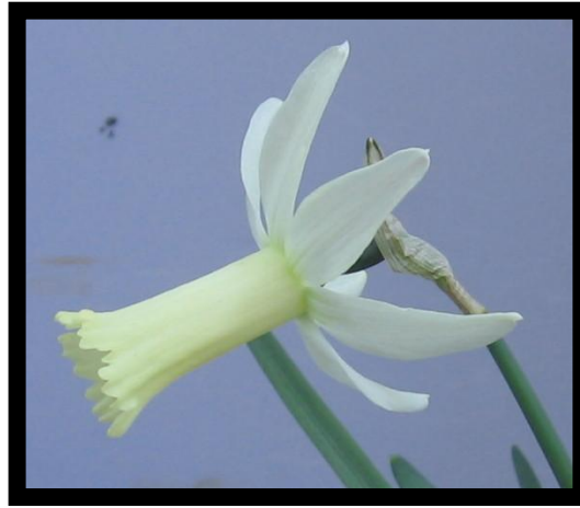
Mitzy 6 W-W