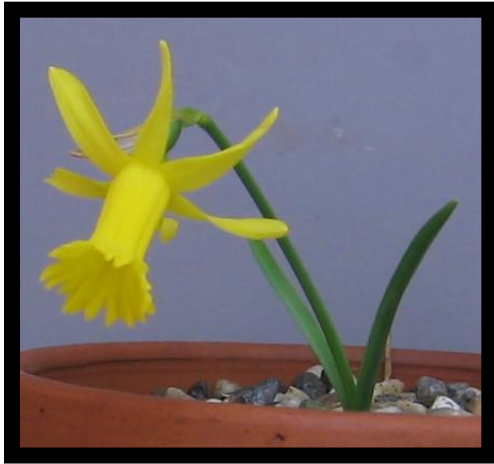
N. asturiensis x N. cyclamineus

My main interest is the miniatures. In December of 2010, the temperatures were colder than is normal for the area. In late January and early February, I had an abundance of Division 1 and Division 6 in bloom. Here are a few of the ones that were blooming.