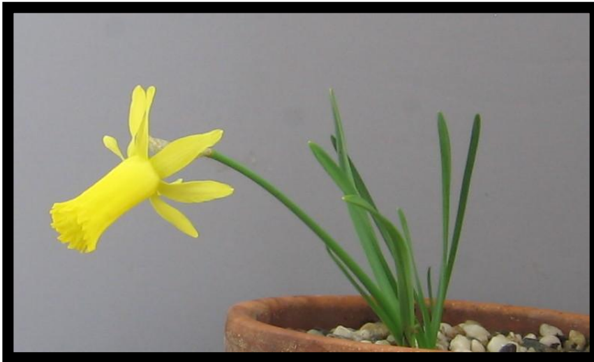
Sidora 1 Y-Y