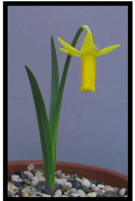
Star Song 6 Y-Y

I live in Alameda right off the San Francisco Bay, just west of Oakland, CA. The weather is very mild and is similar to San Francisco.