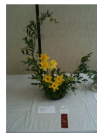
Design Entry “Starting Gate”